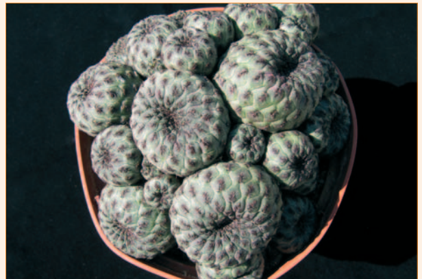
Fig. 5 Sulcorebutia rauschii underpotted and distorting the plastic pot