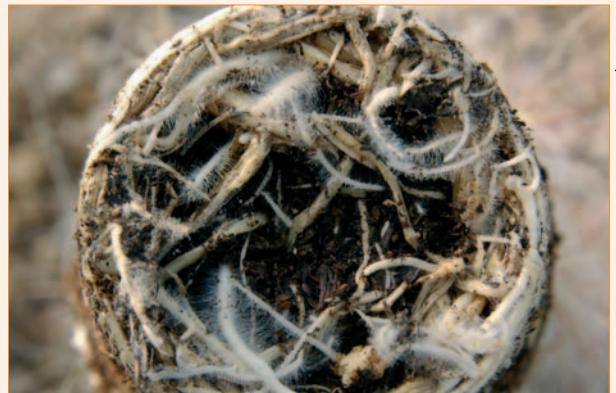
Fig. 4 The root ball of an Oreocereus showing a healthy root system but with little compost visible and now in need of potting-on to a larger sized pot

After potting on/repotting, make sure that you do NOT water the plant for at least 1–2 weeks, or even longer where the roots have been damaged or there has been any rot which you have had to cut off, or if the repotting has been done in winter.