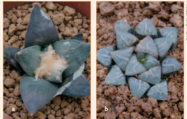
Fig. 2 (a) Ariocarpus retusus , (b) Haworthia bayeri both successfully growing in pure Akadama

A popular substrate in use today, particularly for plants that are prone to lose their roots, is an inert clay granular substance. Two popular makes are Seramis and Akadama which can be used alone or as an additive to regular compost mix. These materials hold some water but are very free-draining, with air spaces at the roots which all cacti and succulents need.