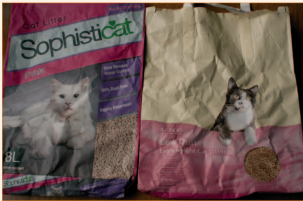
Fig. 3 The 'right' types of cat litter!

A cheaper substitute for these two brands is cat litter but it must be a dust-free, non-clumping type.